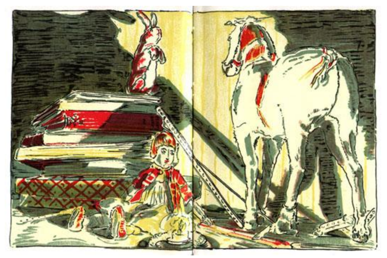
The Skin Horse Tells His Story

"I suppose you are real?" said the Rabbit. And then he wished he had not said it, for he thought the Skin Horse might be sensitive. But the Skin Horse only smiled.