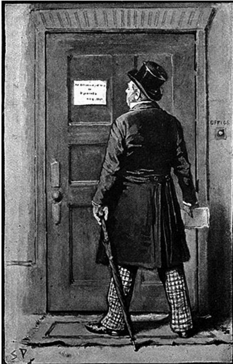
"THE DOOR WAS SHUT AND LOCKED"

"‘Well,’ said I, ‘the gentleman at No. 4.’