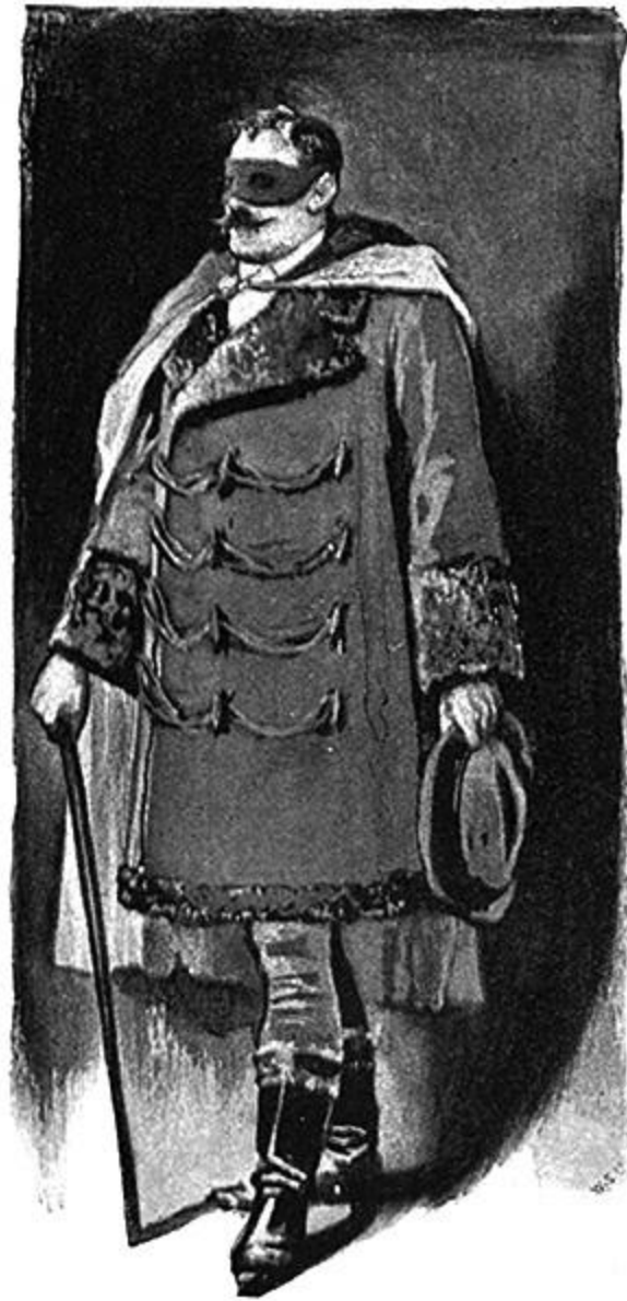
"A MAN ENTERED"

A man entered who could hardly have been less than six feet six inches in height, with the chest and limbs of a Hercules. His dress was rich with a richness which would, in England, be looked upon as akin to bad taste. Heavy bands of Astrakhan were slashed across the sleeves and fronts of his double-breasted coat, while the deep blue cloak which was thrown over his shoulders was lined with flame-colored silk, and secured at the neck with a brooch which consisted of a single flaming beryl. Boots which extended half-way up his calves, and which were trimmed at the tops with rich brown fur, completed the impression of barbaric opulence which was suggested by his