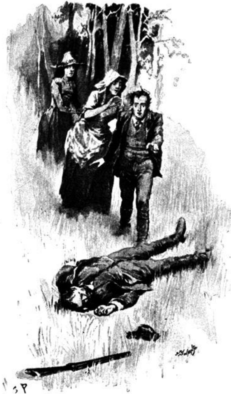
"THEY FOUND THE BODY"

quote this as a trivial example of observation and inference. Therein lies my métier , and it is just possible that it may be of some service in the investigation which lies before us. There are one or two minor points which were brought out in the inquest, and which are worth considering."