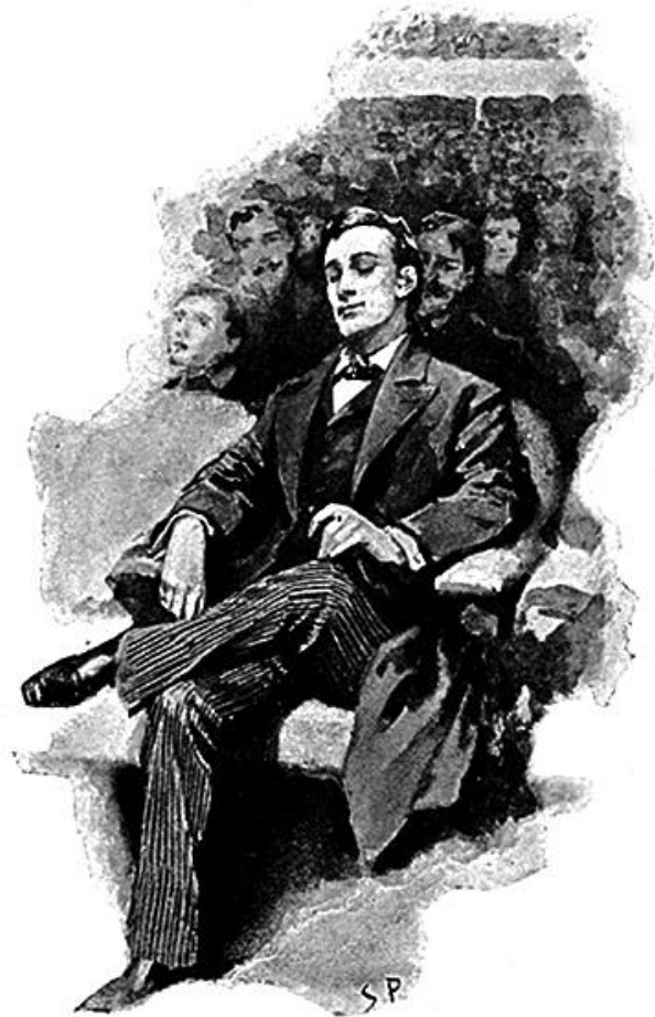
“ALL AFTERNOON HE SAT IN THE STALLS”

“Very well. And, I say, doctor, there may be some little danger, so kindly put your army revolver in your pocket.” He waved his hand, turned on his heel, and disappeared in an instant among the crowd.