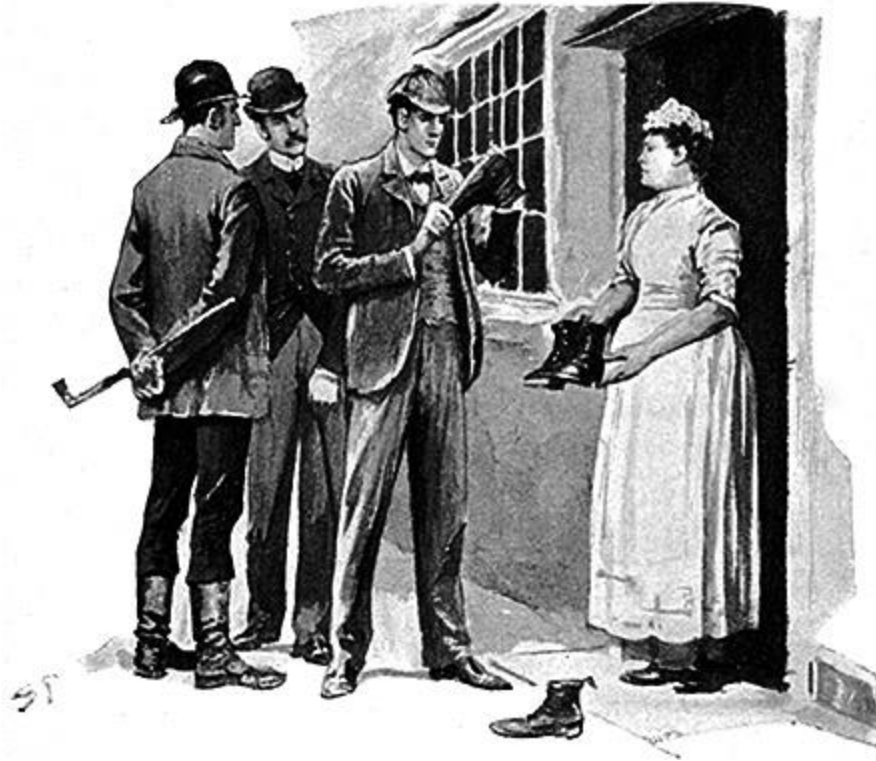
"THE MAID SHOWED US THE BOOTS."

request, showed us the boots which her master wore at the time of his death, and also a pair of the son's, though not the pair which he had then had. Having measured these very carefully from seven or eight different points, Holmes desired to be led to the court-yard, from which we all followed the winding track which led to Boscombe Pool.