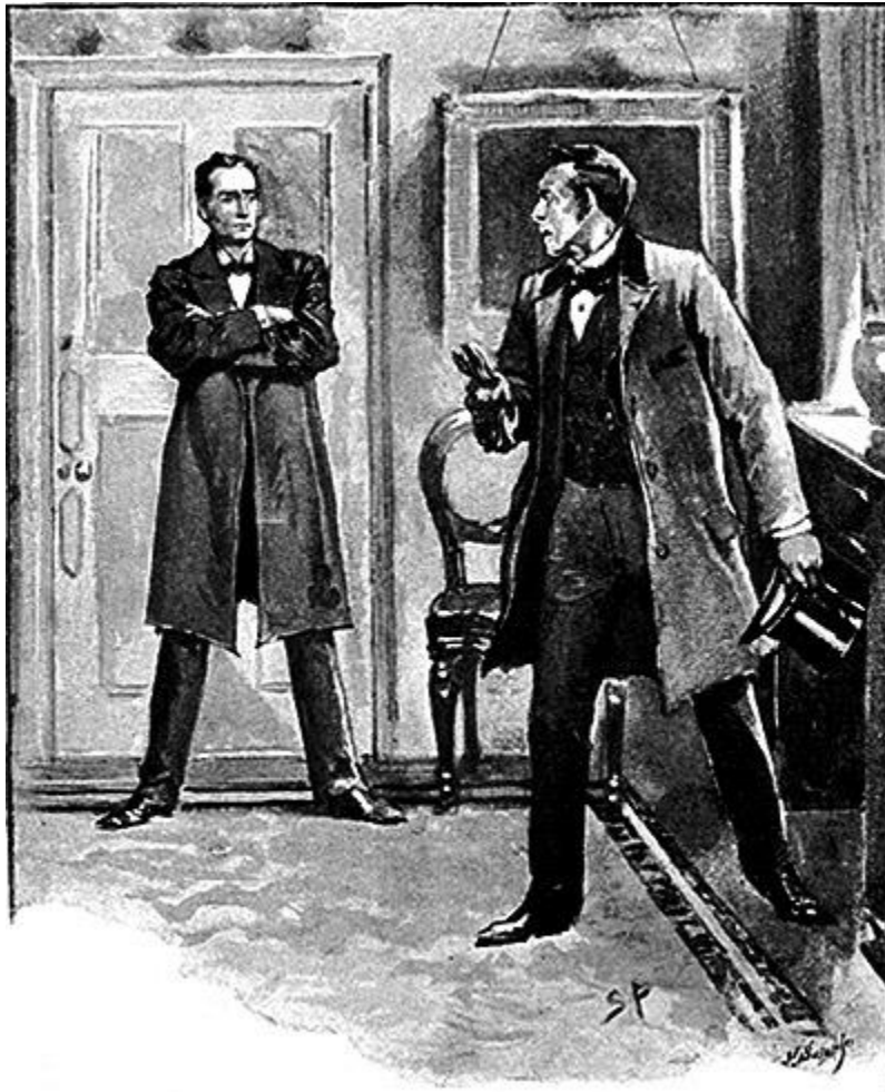
"GLANCING ABOUT HIM LIKE A RAT IN A TRAP"

"It was only a joke at first," groaned our visitor. "We never thought that she would have been so carried away."