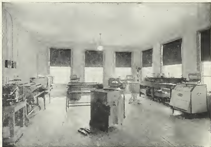
The light and spacious testing laboratory of the Department of Household Engineering, where all household devices must be tested and approved before they may be advertised in Good Housekeeping.