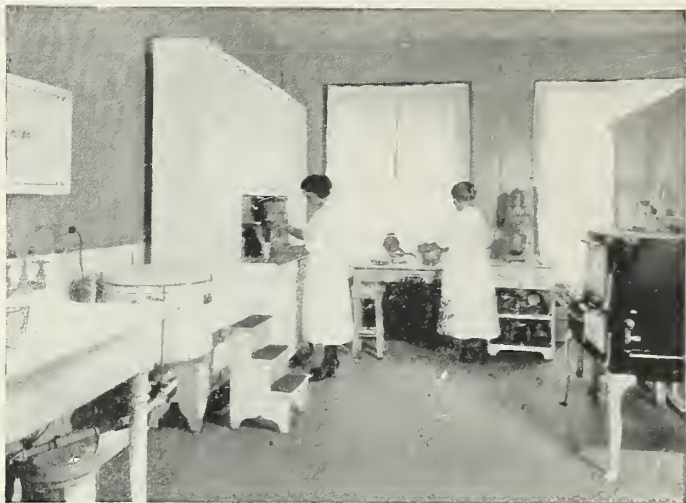
One of the three kitchen-laboratories of the Department of Cookery of Good Housekeeping Institute, where recipes are tested, tasted, and approved before they appear in the pages of Good Housekeeping.