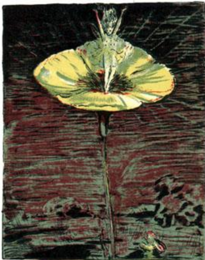
The Fairy Flower

"You were Real to the Boy," the Fairy said, "because he loved you. Now you shall be Real to every one."