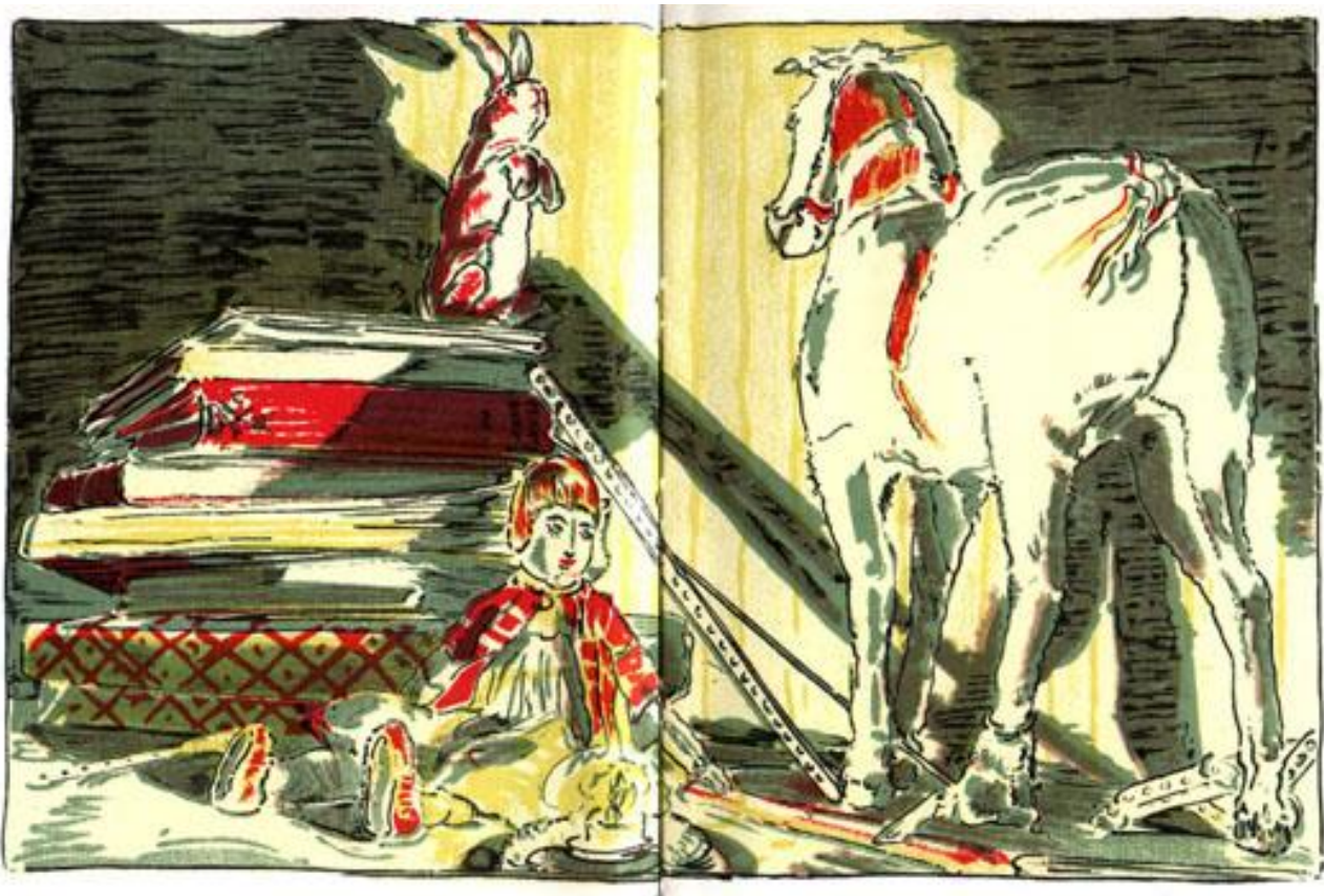
The Skin Horse Tells His Story

"I suppose you are real?" said the Rabbit. And then he wished he had not said it, for he thought the Skin Horse might be sensitive. But the Skin Horse only smiled.